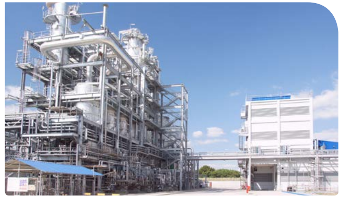
Corbion factory in Thailand

Lactic Acid is a natural product derived from fermentation. It is naturally present in all living species. It is safe and natural and can be applied through feed. It is suitable for all animal species. Most applications of Lactic Acid are through feed, but also adding it to drinking water is an option.