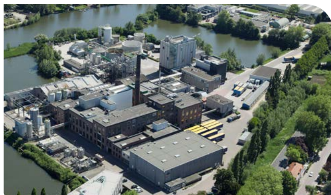
Corbion factory in The Netherlands