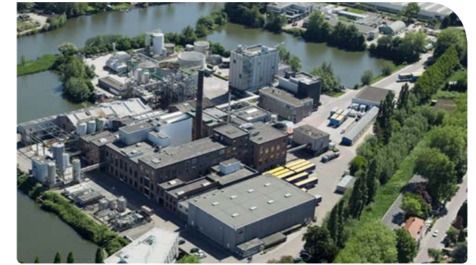
Corbion factory in The Netherlands